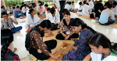
Hand on experience

The GRF is an international organization contributing towards a sustainable world based on Mahatma Gandhi's legacy in nonviolence. Besides focusing on research and the propagation of Gandhian values, the GRF also trains young leaders to initiate community transformation by equipping them with the appropriate systemic tools and techniques.