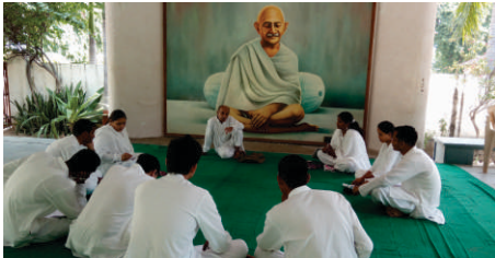
Leadership exposure visit