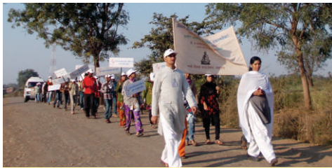
Rural transformation - Padyatra