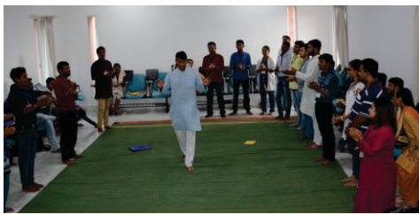
Learning by playing