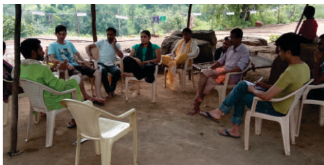
Leadership exposure visit