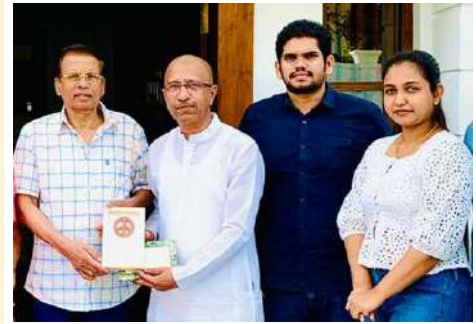
H.E. Mr. Maithripala Sirisena the sixth President of Sri Lanka