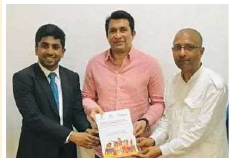
Mr. Roshan Ranasinghe Minister of Sports and Youth Affairs and Irrigation, Government of Sri Lanka