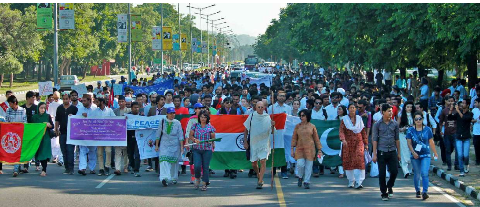
16th Global Youth Peace Fest - GYPF 2023