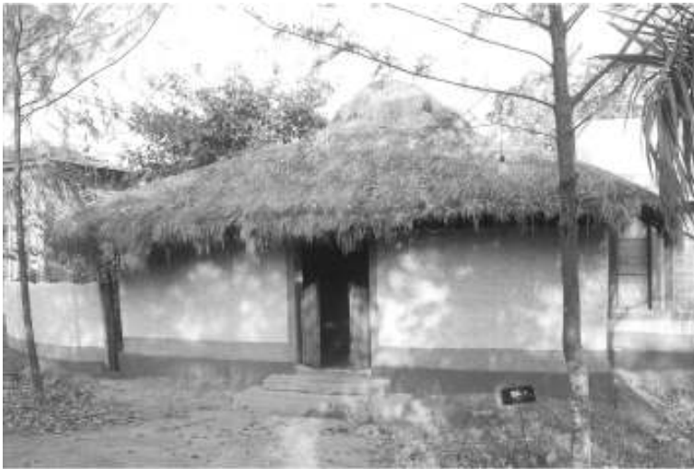
Ghotul : Community house of the Gond tribal

We started constructing hospital which resembled a tribal hamlet. It had a waiting room for the incoming patients.