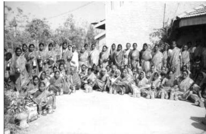
Illiterate mid-wives gather to receive certificates as health workers

Our collaboration with the mid-wives continued for over 12 years, but one question always perplexed us. What motivated the mid-wives to associate with us? We did not pay them. Their clients paid them for what they 'delivered' but that wouldn't have been much. Guests visiting SEARCH