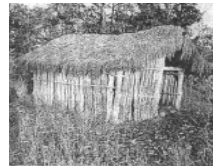
The secluded hut where women had to stay during menstruation

In 1986 bullock carts were the mainstay of transport in Gadchiroli. But at times, especially in rainy season even they