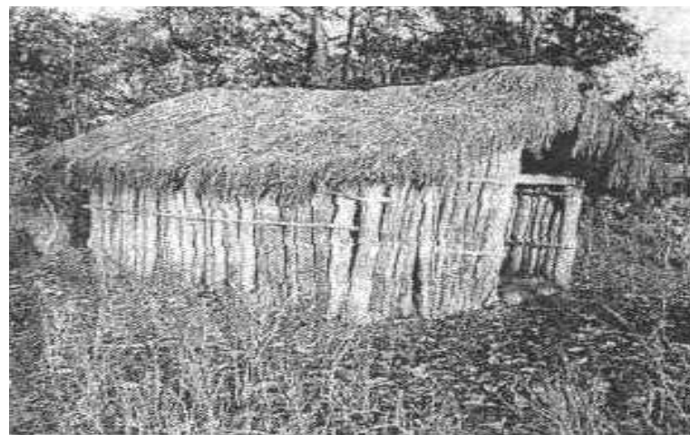
Entrance to Shodhgram

Shodhgram (Search Village) is the name of the campus from where we conduct our work. It has been designed to represent Gandhi's ashram and a tribal village. Situated inside the forest among tribal villages it is here that we live with colleagues and their families. It is from here that we treat, train, research and seek solutions to people's health issues with their active participation.